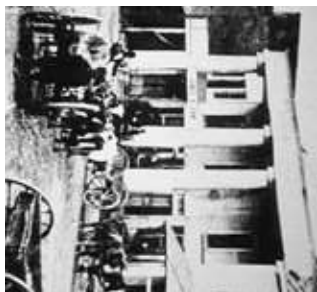
First Lodge Hall - 1849