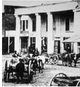
First Lodge Hall - 1849

Forrest Masonic Lodge No. 19 is the oldest organization in Huntsville. One of 25 Masonic Lodges chartered by the Grand Lodge of the Republic of Texas, Forrest Lodge has served the Huntsville and Walker County communities for over 161 years. Of the 25 Lodges chartered