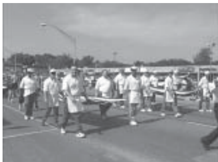
Forrest Lodge Members Carry Flags in 4th of July Parade

Masonic Home & School of Texas Scottish Rite Children's Hospitals York Rite Eye Foundation Shriners Crippled Children's Hospitals Texas Masonic Retirement Center Shriners Burn Institutes